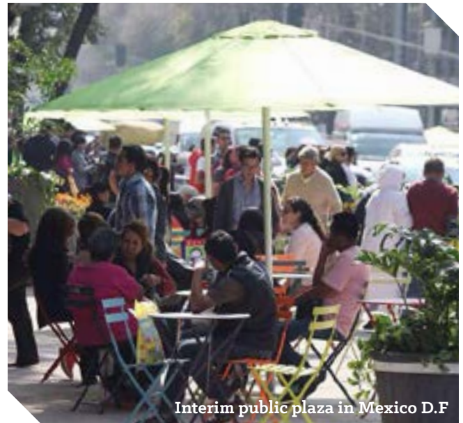
Interim public plaza in Mexico D.F

International Members have access to NACTO's peer-to-peer network and participate in both the Cities for Cycling and Designing Cities initiatives. They will also maintain sub-groups devoted to issues specific to their country, working together to change entrenched policies, reevaluate national design standards, and confront common obstacles.