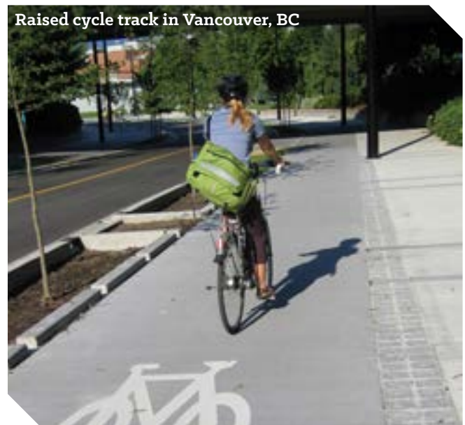
Raised cycle track in Vancouver, BC

CITIES IN CANADA AND MEXICO FACE MANY OF THE SAME OBSTACLES AS US CITIES AND ARE USING A SIMILAR TOOLKIT TO TRANSFORM THEIR STREETS.