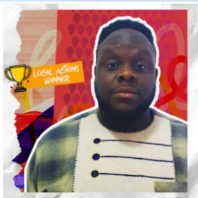
PROVIDENCE KLUGAN GHANA