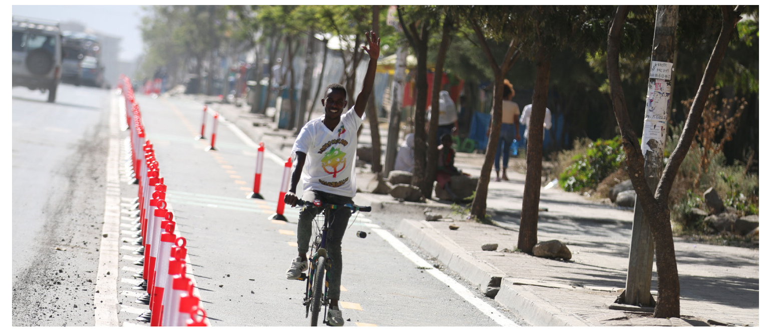
*The following data has been aggregated from a series of surveys conducted on site, courtesy of the Addis Ababa Transport Bureau