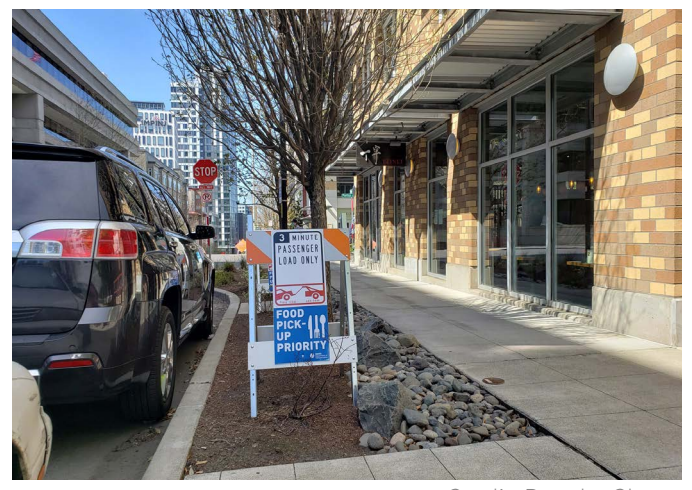
Seattle, WA, USA